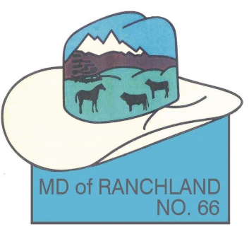
Bulletin Content Written by MD of Ranchland Agriculture Staff