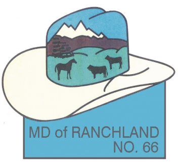
Bulletin Content Written by MD of Ranchland Agriculture Staff