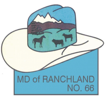
Bulletin Content Written by MD of Ranchland Agriculture Staff