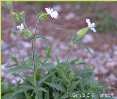
Gerald C. Williamson

ID characteristics: leaves teardrop shaped & opposite, leaves & stems hairy, flowers white with 5 notched petals at top of egg-shaped capsule.