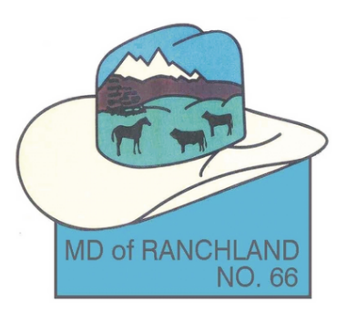
Bulletin Content Written by MD of Ranchland Agriculture Staff