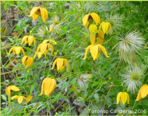
Toronto Gardens, 2016

ID characteristics: young stems green, old stems woody, groups of 5-7 pointed leaflets with toothed edges, flowers yellow and nodding with four pointed petals.